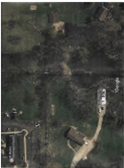
Aerial st Marks and Micek trenches.jpeg 116K